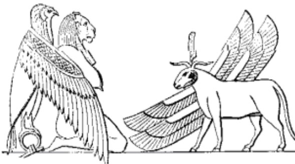
Egyptian False Gods

Here is an angel and when we study to know Who He is, we learn it is none other than Jesus Himself. He stands both on the sea and the earth, meaning the whole world, and makes an announcement, "Time no longer". What time?